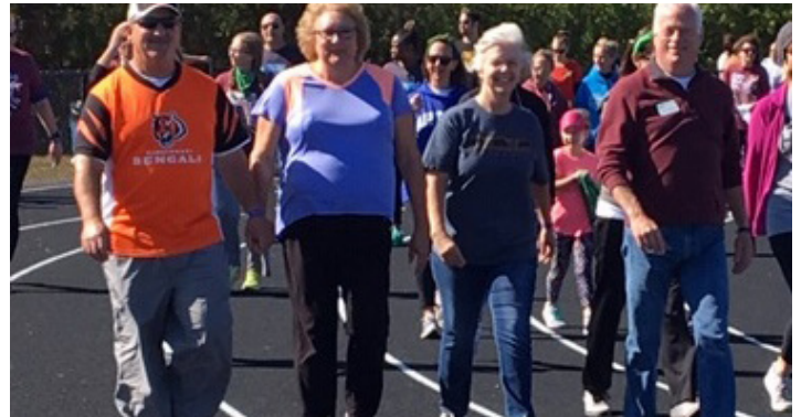
MHRB staff stepped out to walk for suicide awareness in walk to benefit SAVE (Suicide Awareness Voices of Education) in October 2019.