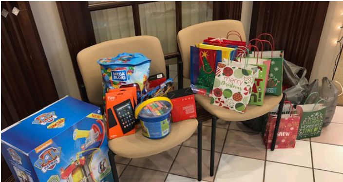
MHRB staff donated presents to Warren County Children Services to help make Christmas 2019 a bit brighter for kids in foster care.