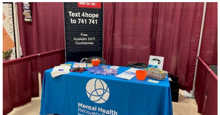
Events like “Let’s Lebanon!” provided an avenue for MHRB to share information and education about the importance of treating mental health and substance use disorders.