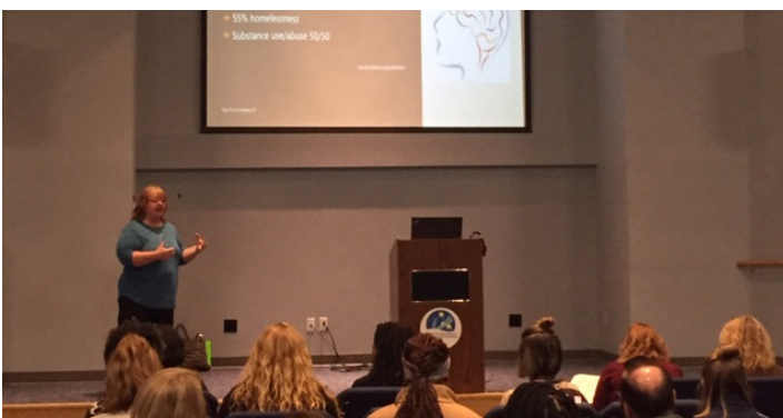
At left: MHRB and contracted provider agencies sponsored trainings for staff and affiliated agencies, such as this training on trauma and human trafficking in October 2019.